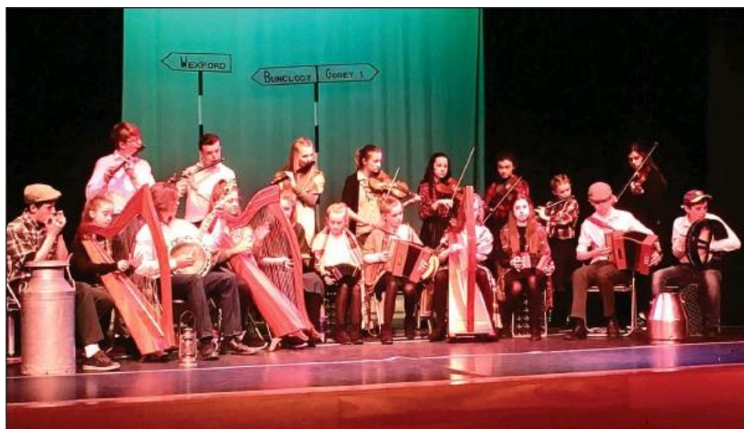
Figure 1: 2017 PLÉARACHA Winners CCE Gorey Ballygarrett

The objective of PLÉARACHA & SCORAÍOCHT competitions is to provide activity, for as wide as possible a range of branch members, and to encourage initiative in the presentation of Irish Traditional Music, song, dance, Irish language, storytelling and recitation. The SCORAÍOCHT competition was particularly intended for those with a flair for inventive presentation and depends very much on the skill of a producer with knowledge of all principles of stage presentation.