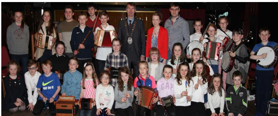
Figure 2: 2017 PLÉARACHA Runner-Up Winners CCE Cleary Coyne